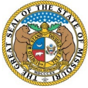
EXHIBIT A PROPOSAL SIGNATURE PAGE

STATE OF MISSOURI OFFICE OF ADMINISTRATION DIVISION OF PURCHASING (PURCHASING) REQUEST FOR PROPOSAL (RFP)